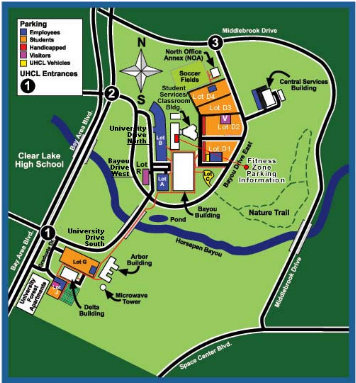
ACT Summer Institute events take place in the Bayou Building.